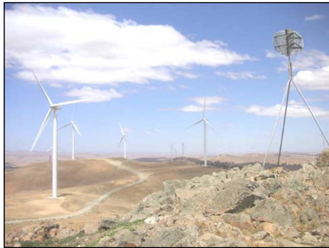
Hallett Wind Farm—South Australia