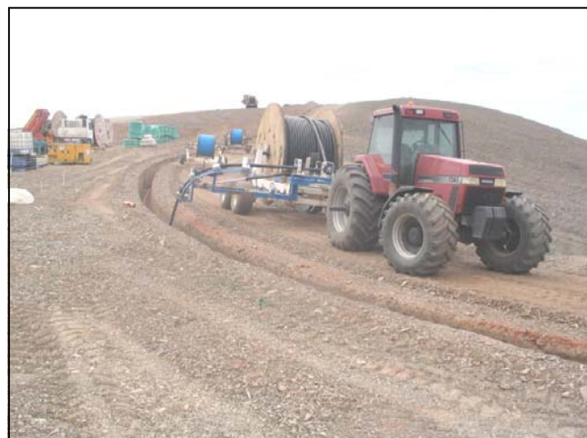
Electrical cable laying during construction

Access tracks to each turbine, usually made of gravel, need to be between 6 and 12 metres in width during construction. Interconnecting electrical cabling between