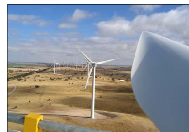
Nacelle view of wind farm

Depending on the site, agricultural aviation such as crop dusting or super phosphate spreading may be affected. Agricultural pilots are usually highly trained and operate very manoeuvrable aircraft at extremely low altitudes, consequently they are best placed to assess the potential impact.